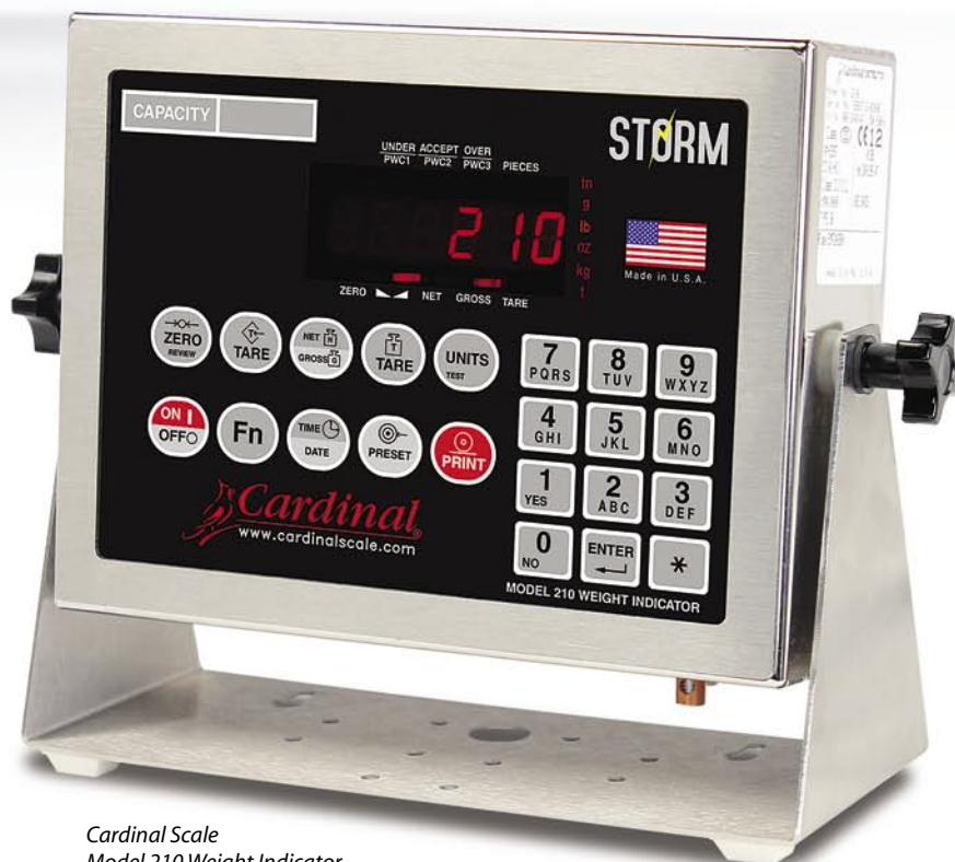
Cardinal Scale Model 210 Weight Indicator